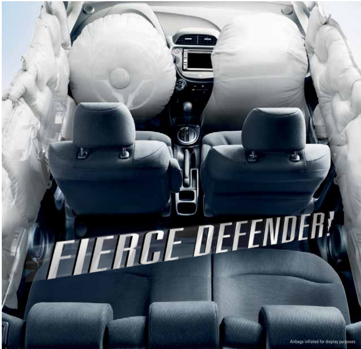
Airbags inflated for display purposes.